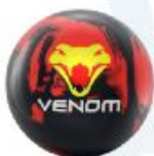
MOTIV Lethal Venom