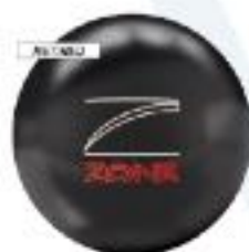
Brunswick Vintage Danger Zone