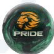
MOTIV Pride Empire